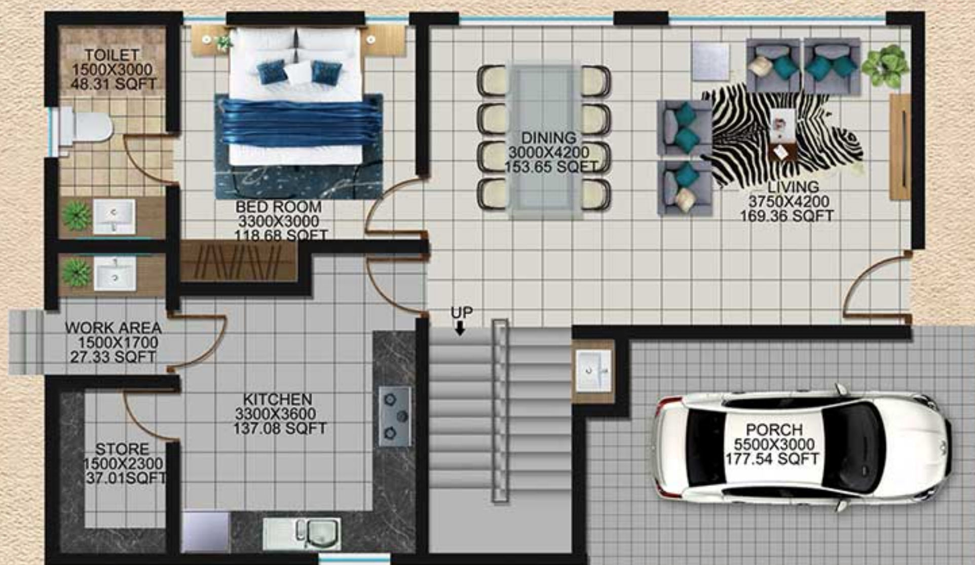
GROUND FLOOR 3 BED ROOM AREA DETAILS : 1064 Sqft