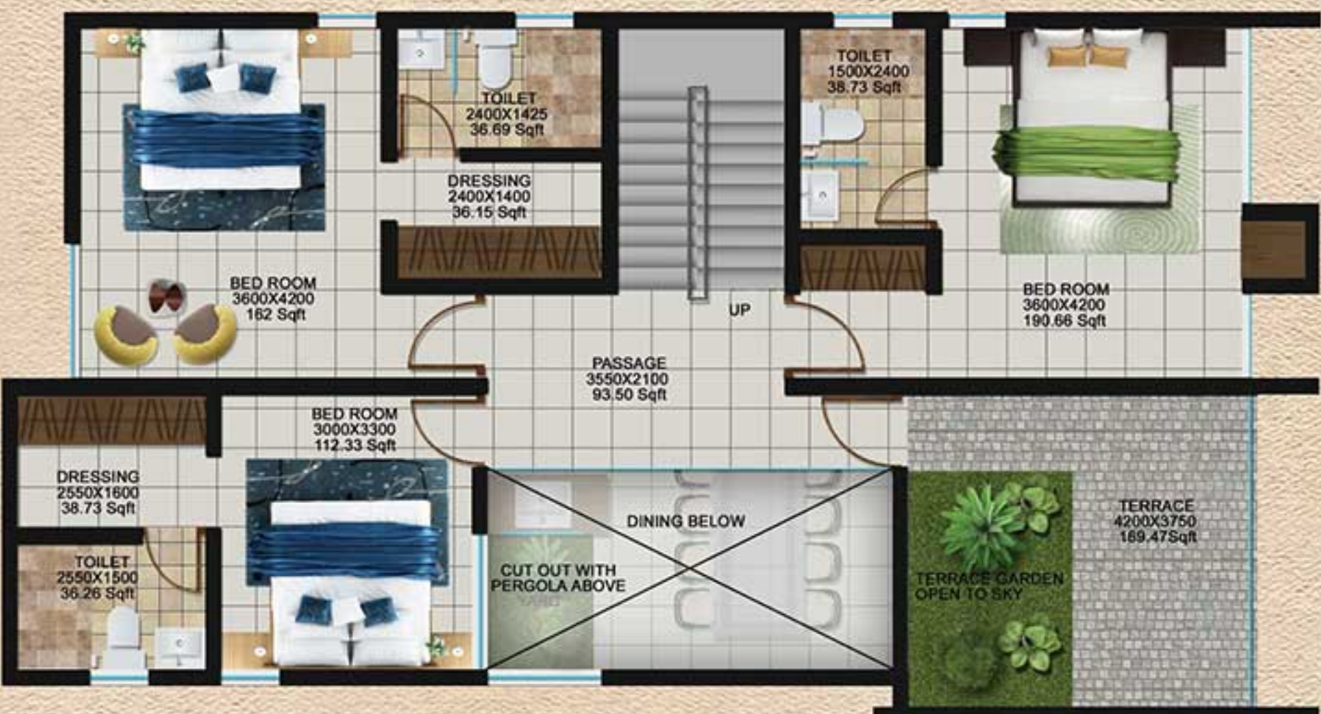
FIRST FLOOR 4 BED ROOM AREA DETAILS : 1206 Sqft