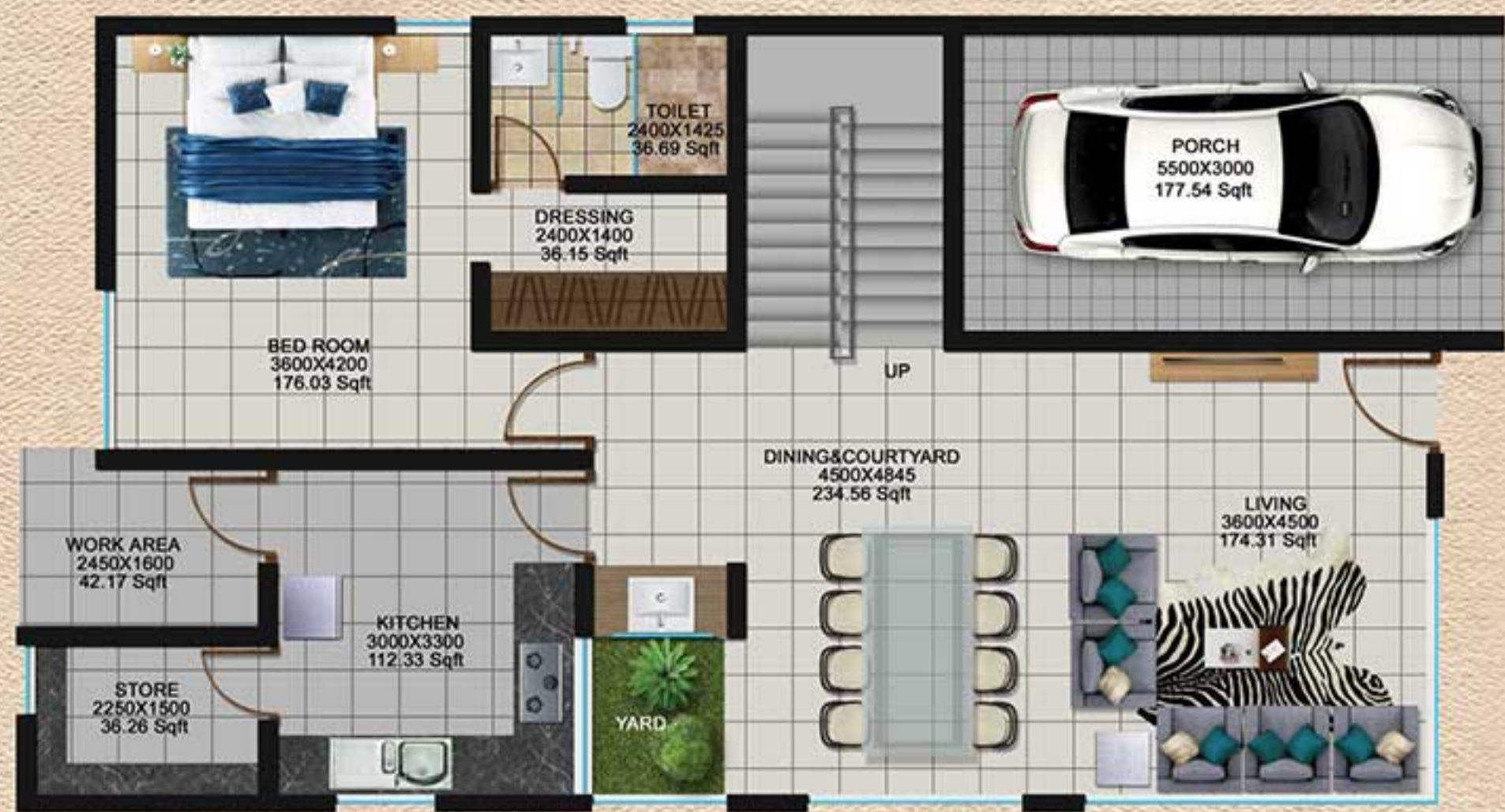
GROUND FLOOR 4 BED ROOM AREA DETAILS : 1248 Sqft