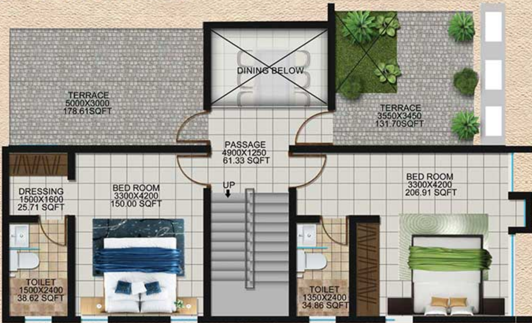
FIRST FLOOR 3 BED ROOM AREA DETAILS : 819 Sqft